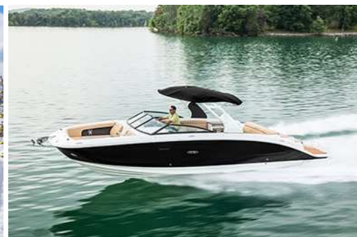
Boating & Watersports