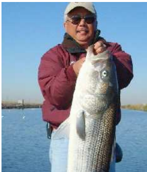
Fishing Gear & Seminars