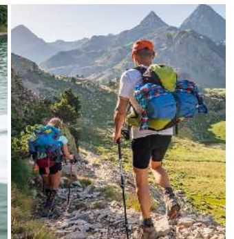
Hiking, Camp & Trail

@the Grounds - 700 Event Center Dr, Roseville, CA 95678 PLACER COUNTY