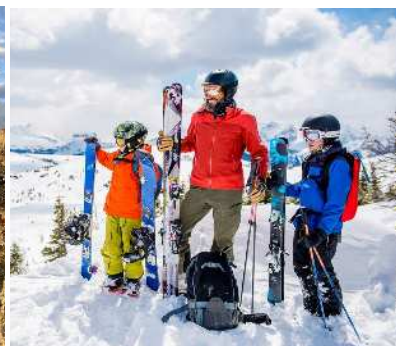
Winter Sports Equipment