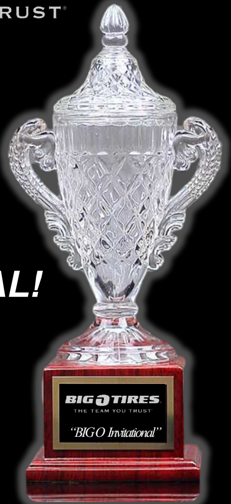
"BIG O Invitational Cup"

10am-5pm @ the Grounds PLACER COUNTY 700 Event Center Dr, Roseville, CA